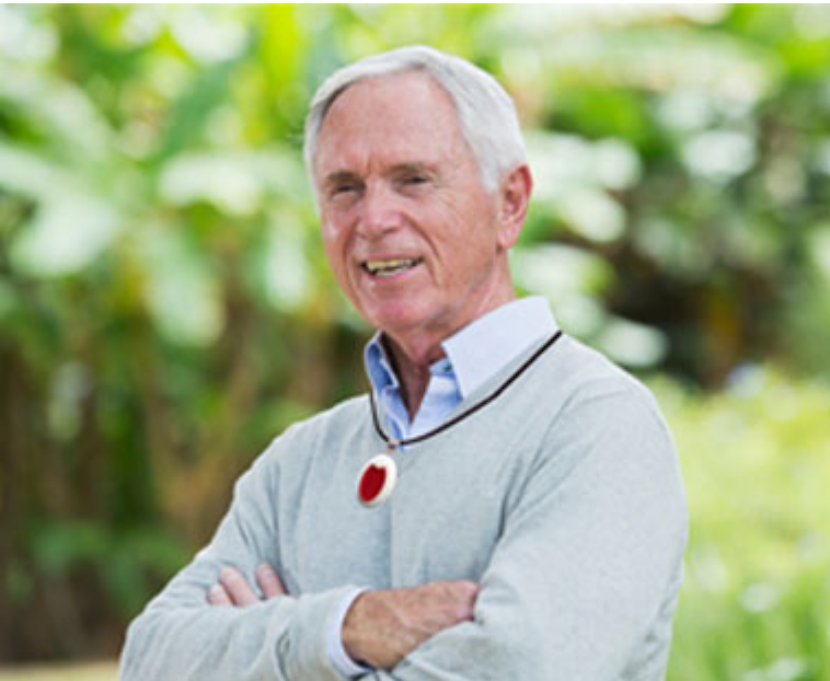
Fall Detection Alarms