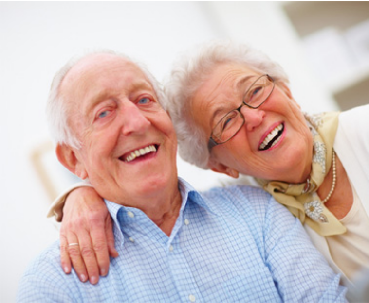
SureSafeGO 'Anywhere' Alarms